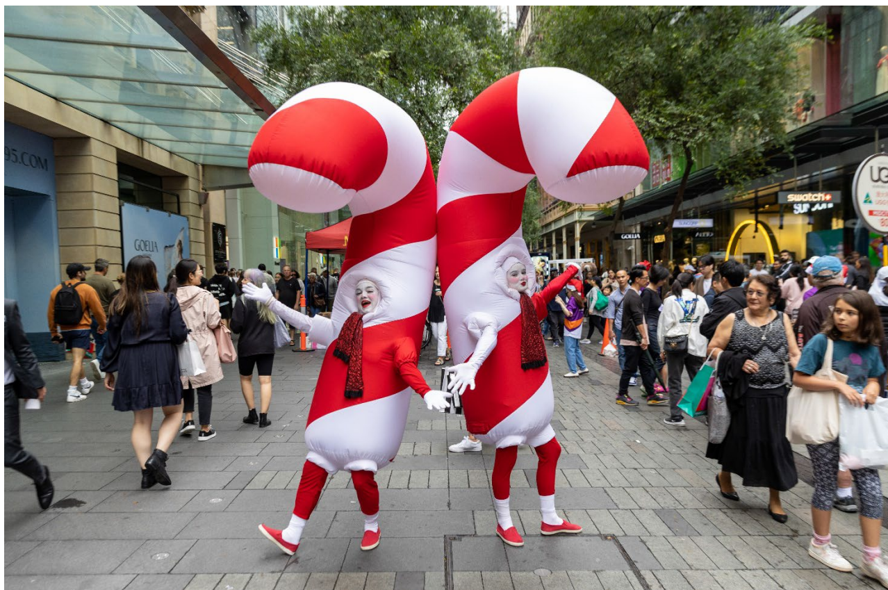
Image 11. City of Sydney Christmas retail weekend event, Pitt Street Mall, Sydney November 2023.

The City did not enter into any environmental upgrade agreements in 2023/24.