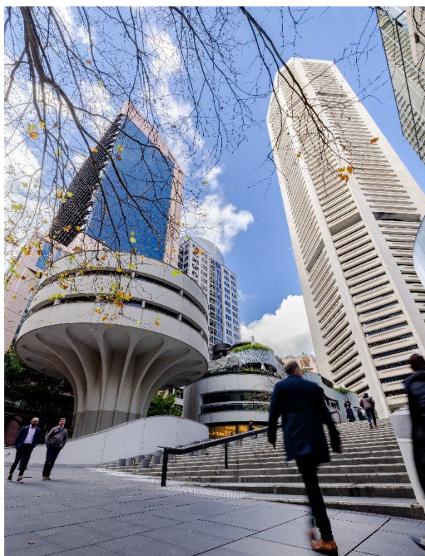
Image 12. MLC centre, Martin Place, Sydney.

The plans will provide a coordinated management framework across government to improve the health of Sydney Harbour, the Cooks River and their catchments.