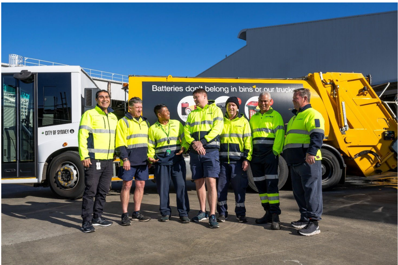
Image 8. City of Sydney cleansing and resource recovery staff members.

The City was awarded the NSW Local Government Award for Diversity and Inclusion, and the NSW UDIA and MYBOS Diversity and Inclusion Award for Excellence.