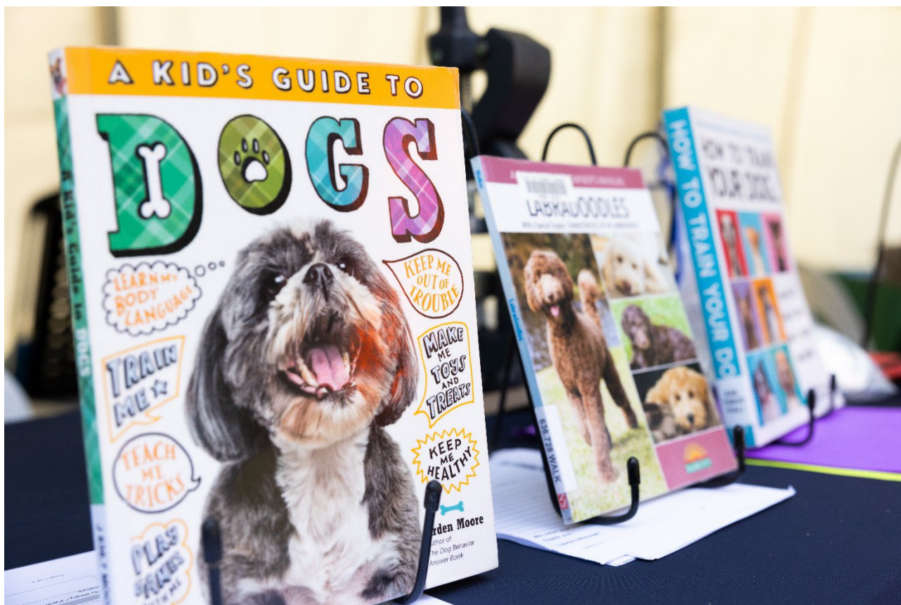
Image 10. Stall at Northcott Pet Day, Surry Hills, September 2024.

Redfern Waterloo Pet Day was cancelled in June 2024 due to heavy rain which flooded the venue site.