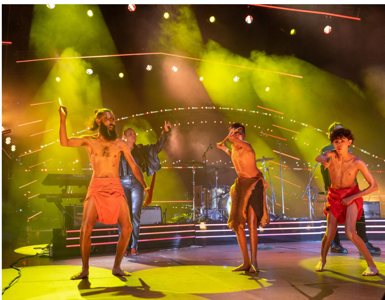
Image 3. Call to Country, New Years Eve 2023.