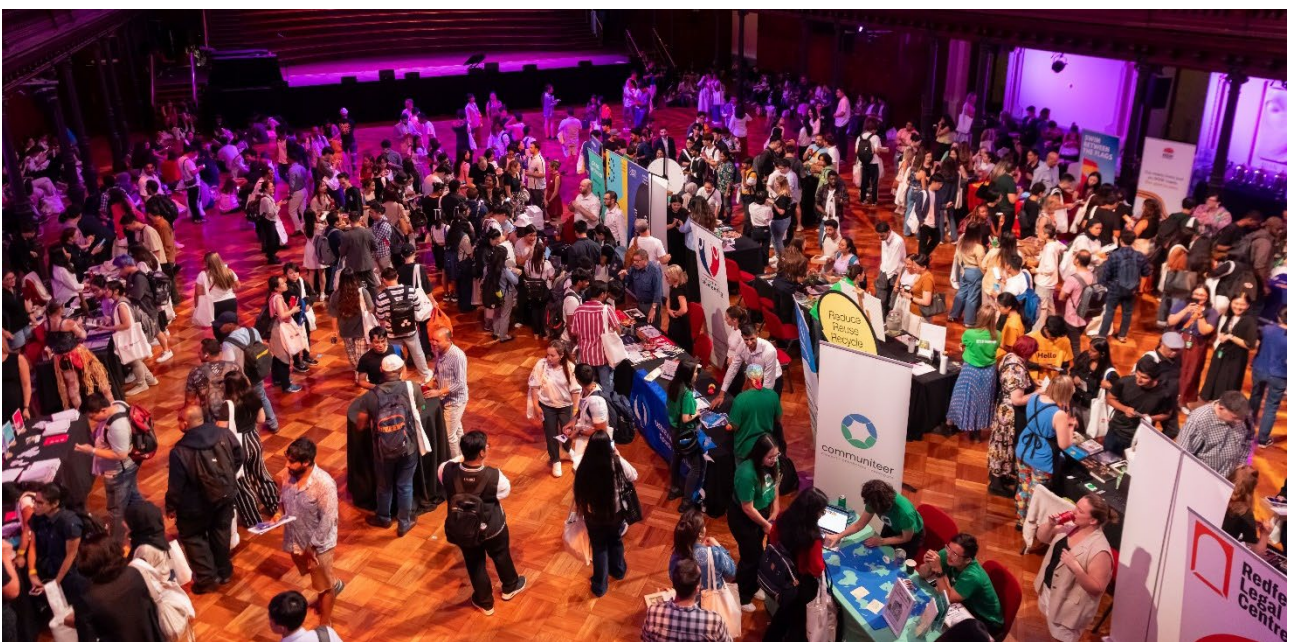
Image 16. Lord Mayor's Welcome for international students, Sydney Town Hall, March 2024.

Of the $1,594,000 total corporate sponsorship revenue received, $142,000 was made up of cash and 1,452,000 was value in kind.