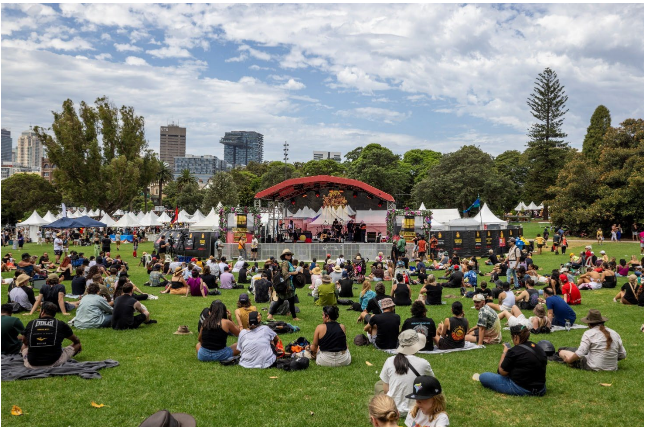
Image 5. Yabun festival, Victoria Park, Camperdown, January 2024.