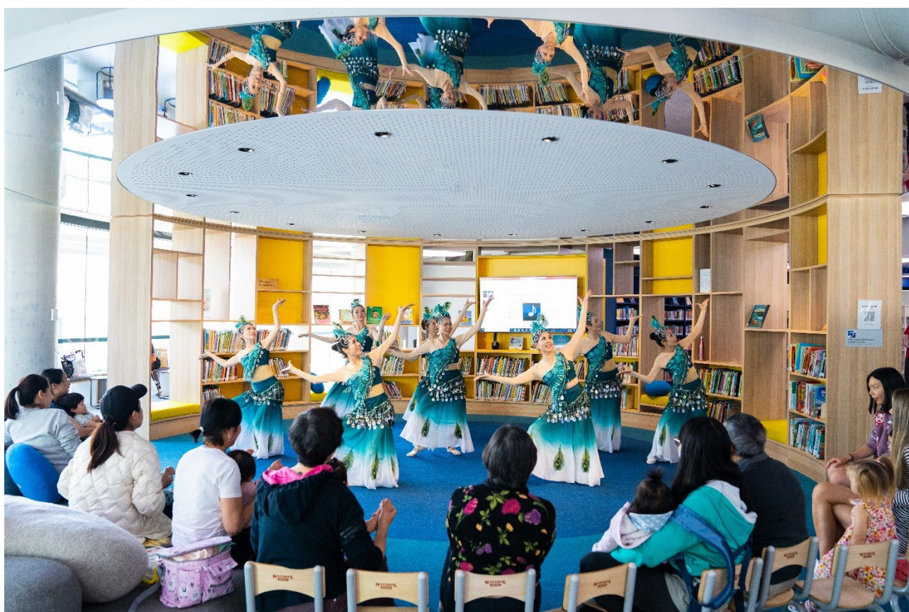
Image 2. Rhymetime at Darling Square Library.

The annual report is at cityofsydney.nsw.gov.au