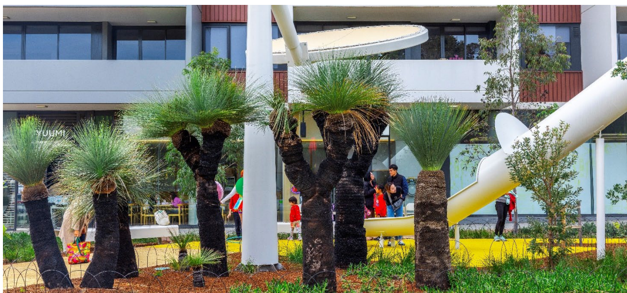
Image 17. Butterscotch Park, North Rosebery.