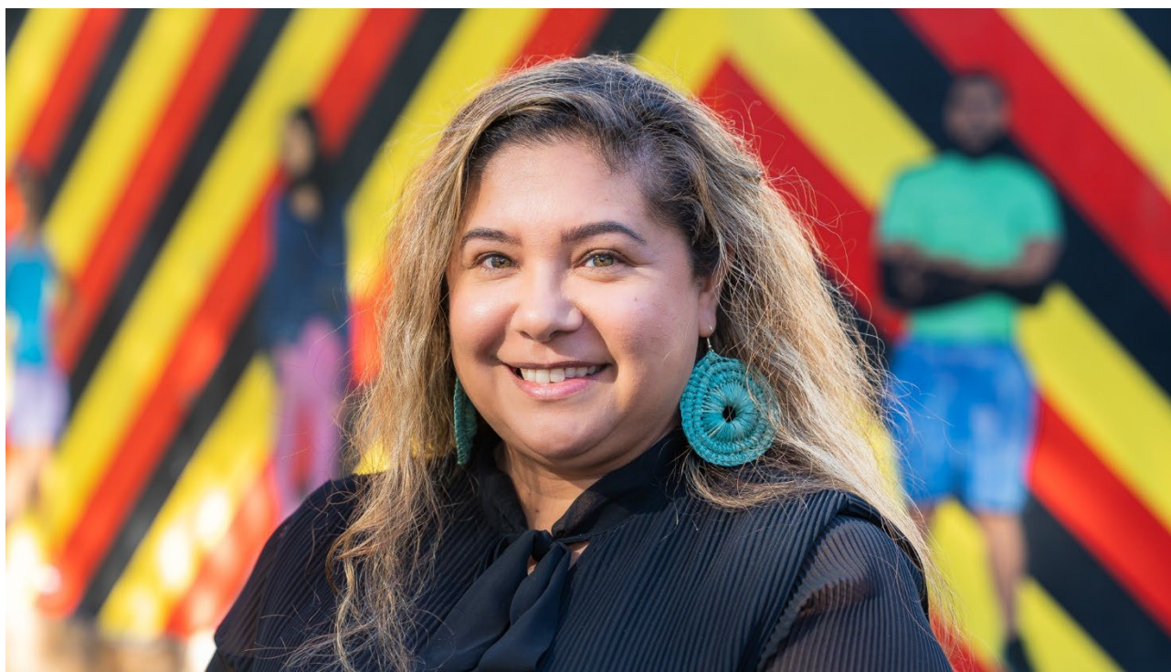
Image 7. The City of Sydney’s Workforce Advisor – Aboriginal & Torres Strait Islander Inclusion.

The City developed employment initiatives that provide opportunities for Aboriginal and Torres Strait Islander candidates, young people with disability and refugees/asylum seekers who face barriers to employment.