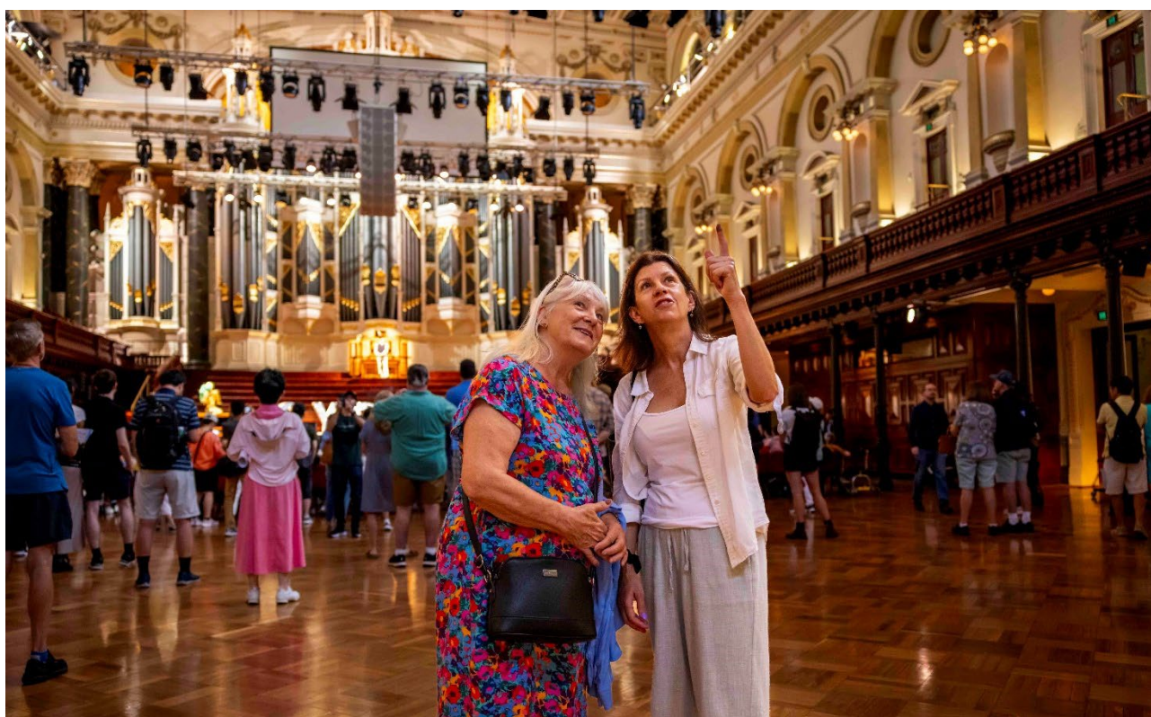
Image 6. Sydney Town Hall open day, March 2024.

Our membership of the Refugee Council of Australia's Refugee Welcome Zone initiative was highlighted and showcased during Refugee Week, with street banners, billboards and display panels across the city promoting messages of welcome.