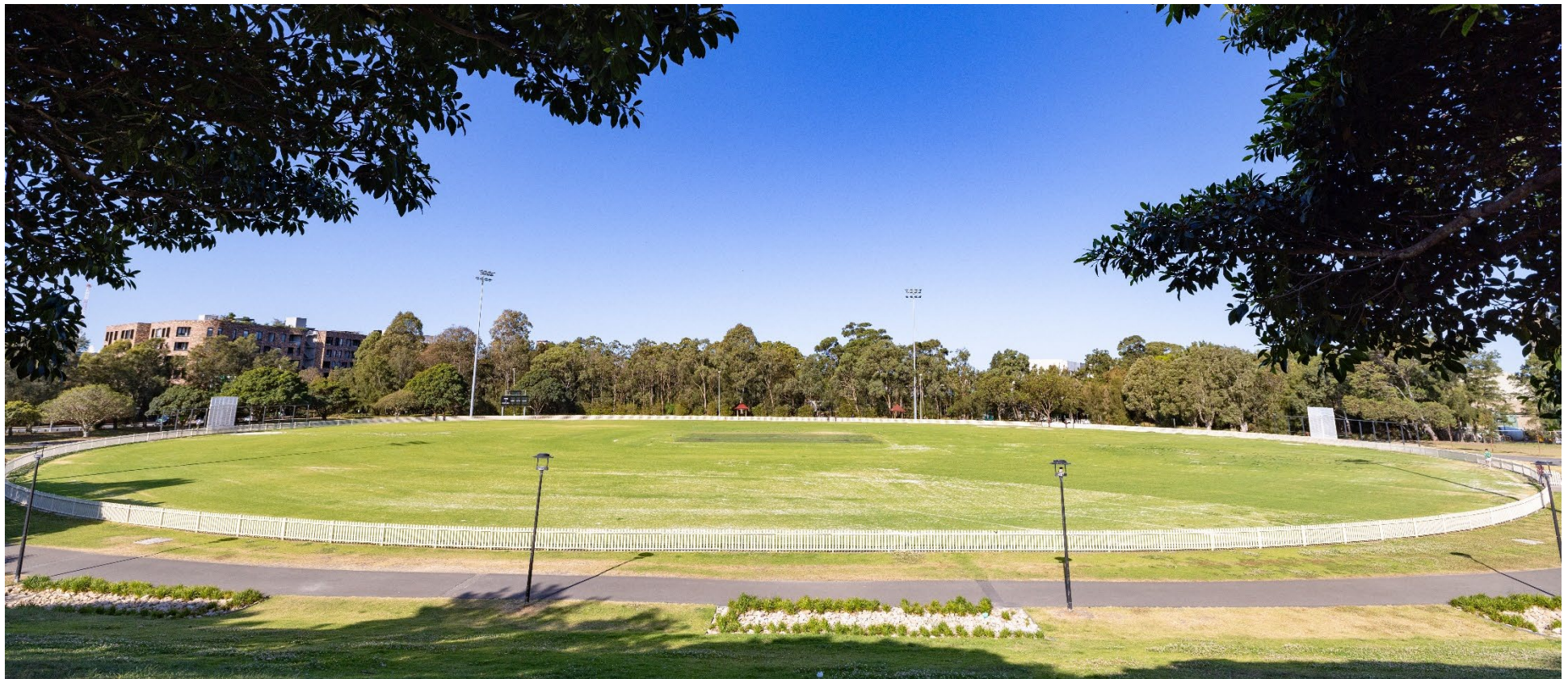
Image 13. Alan Davidson Oval, Alexandria.