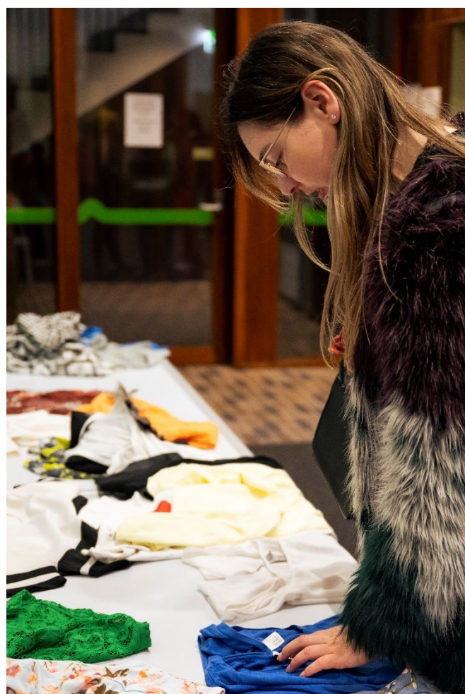
Image 14. Darlinghurst cloths swap event June 2024.

There were 233 visits to the reading room recorded for the year. A virtual online reading room continued to operate.