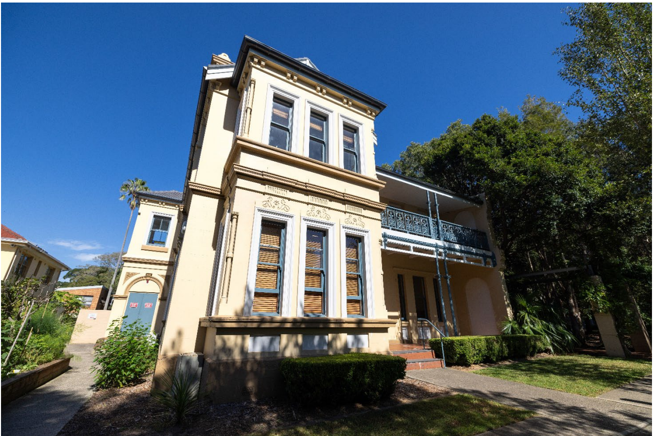
Image 4. Benledi House, Glebe Point Rd, Glebe. Tenants include City of Sydney accommodation grant recipients.