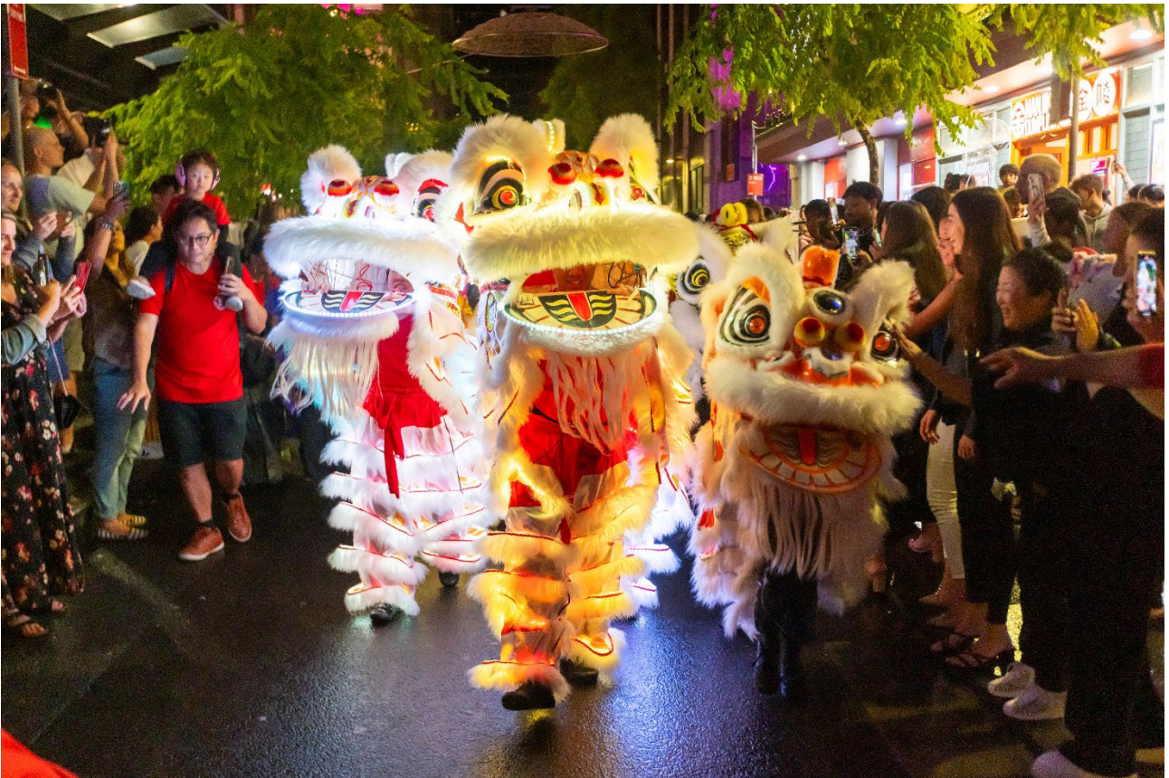
Image 18. Sydney Lunar Streets festival – Haymarket, February 2024.